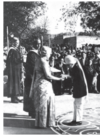
Receiving a prize from Mrs. Vijalakshmi Pandit