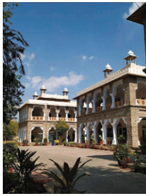
My middle school hostel - Colvin House