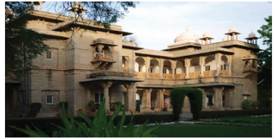
My senior hostel - Ajmer House, with my "Chatri" on the first floor in the foreground

My Alma Mater, MAYO COLLEGE, has just completed 150 years, having been founded in 1875 by the 6th Earl of Mayo, and is known as the 'Eton of the East' for its elite origins. It was originally established for the education of Indian Royalty, but later evolved to serve a broader spectrum of students, maintaining colonial-era architecture and rich traditions.