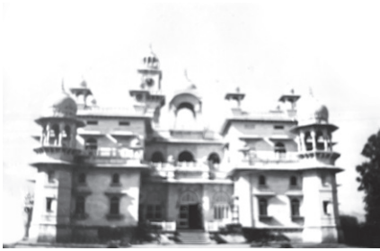
Imposing Main Building